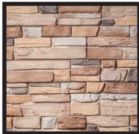
Western Ledge Stak™