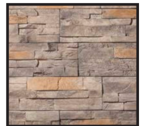
Long Island Stak™